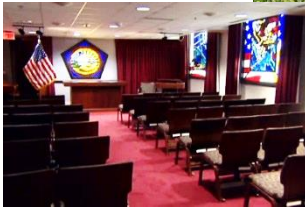
The Pentagon, Arlington County, Virginia