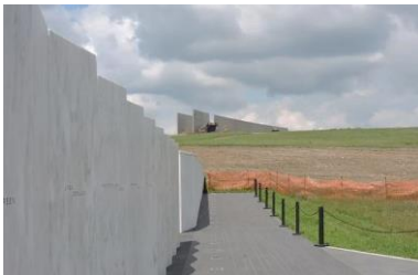
FLIGHT 93, Somerset County, Pennsylvania