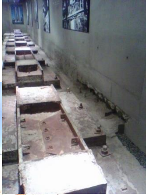
the 9/11 Memorial Museum (lower floor) (image Nov. 6, 2013)